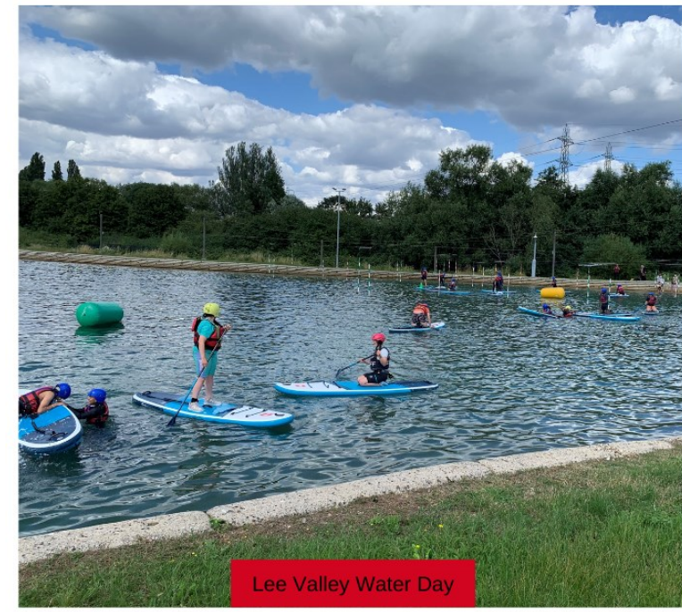
Lee Valley Water Day