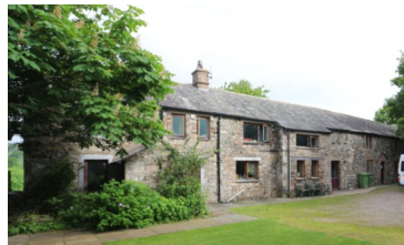
High Row located at the foot of Carrock Fell, The Lake District