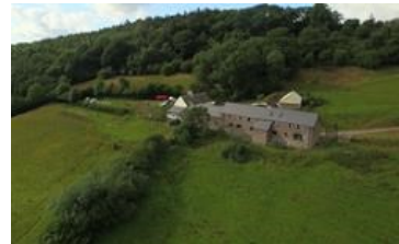
Maes Y Lade Centre located in the Beautiful Brecon Beacons.