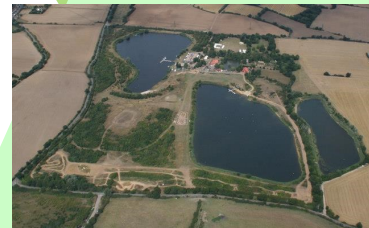
Stubbers Adventure Centre Located in Upminster, Essex