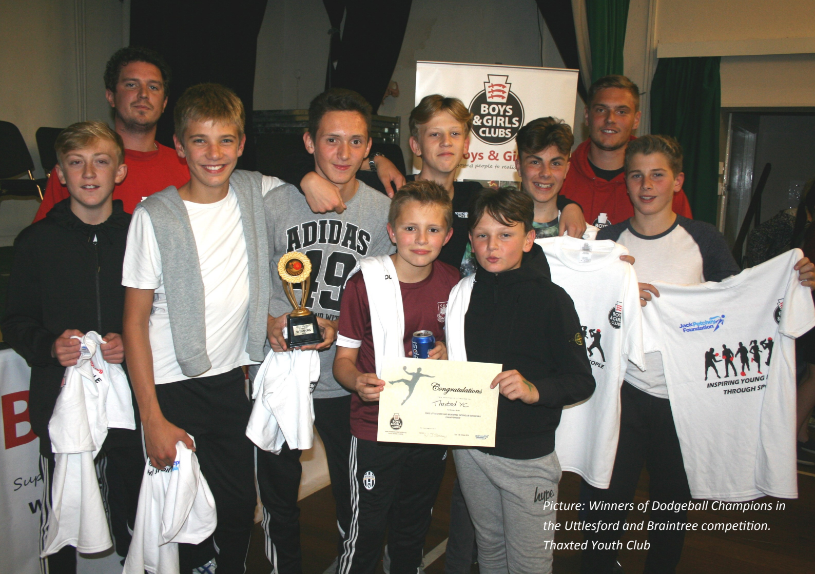
Picture: Winners of Dodgeball Champions in the Uttlesford and Braintree competition. Thaxted Youth Club