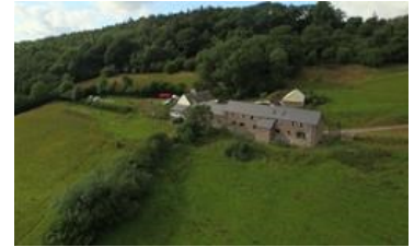
Maes Y Lade Centre located in the Beautiful Brecon Beacons.