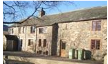
High Row located at the foot of Carrock Fell, The Lake District