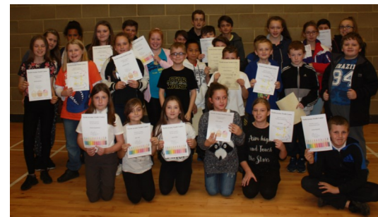
Young people celebrate at the North Avenue Youth Centre Presentation Evening December 2016

All delivered by 33 staff members across 3 offices in 2 countries.