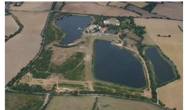
Stubbers Adventure Centre Located in Upminster, Essex