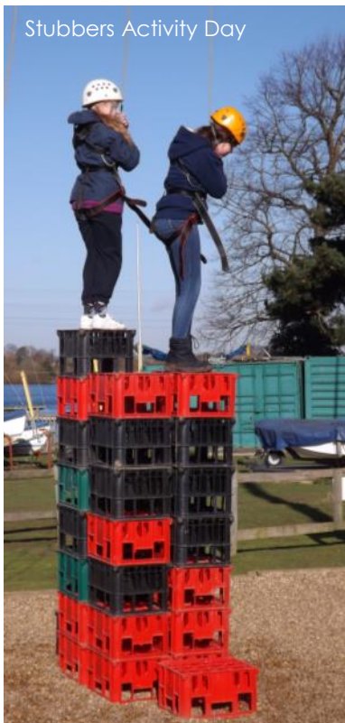
Stubbers Activity Day

"Members don't always know what else they can have or want, so inter-club activities foster the process of thinking outside the box."