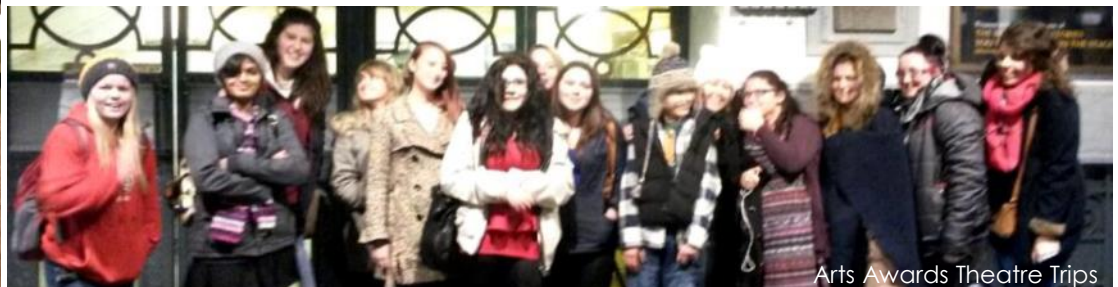
Arts Awards Theatre Trips