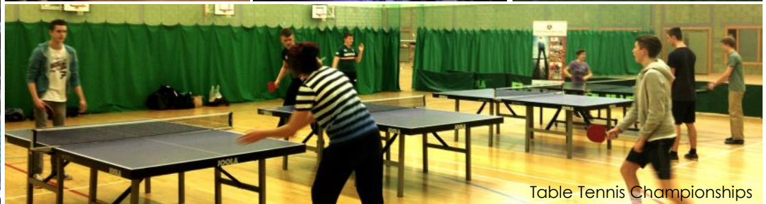
Table Tennis Championships