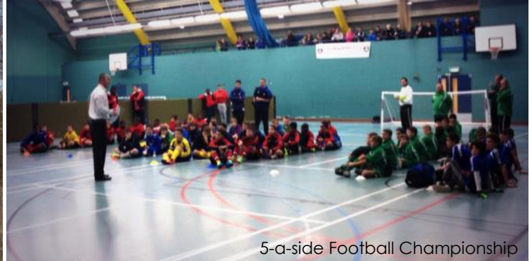
5-a-side Football Championship