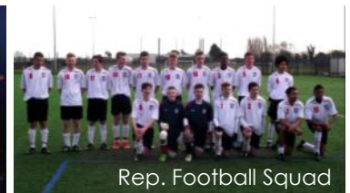
Rep. Football Squad