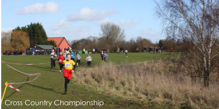
Cross Country Championship