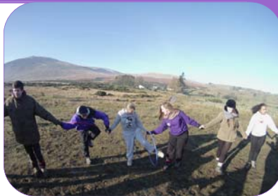
Young Leaders learn from teambuilding exercises