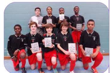
U14 winners: Crown & Manor