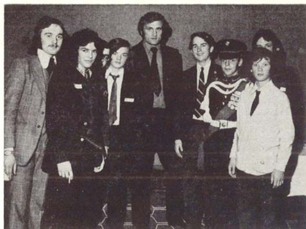
Essex boys meet Joe Bugner at the launching Club Week 1972

Thousands of boys and girls have been members and volunteers in our member clubs since we were set up back in 1939. In 2014, when we'll hit 75 years, we'd like to celebrate in style by gathering our alumni together, whether they're famous or not. Can you help us find them?