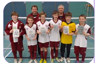
U12 winners: Chelmsford City FC

THANKS TO ALL PARTICIPATING CLUBS: Ashingdon Youth FC, Basildon Boys FC, Berry Boys, Brentwood Youth FC, Chelmsford City FC, Crown & Manor, Ingatestone Boys Own Club, Island Boys & Girls FC, Linford Wanderers FC, Wivenhoe YFC.