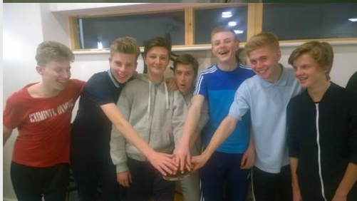
Prospects FC boys having a laugh posing for a team shot