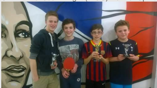
IBOC boys line up for a team shot