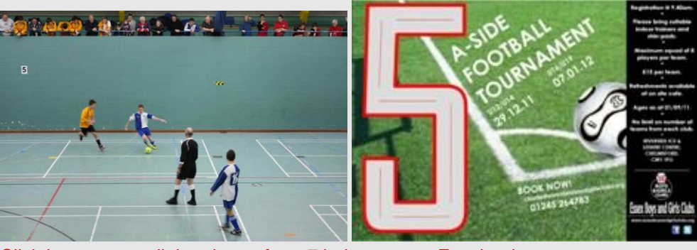
Click here to see all the photos from 7th January on Facebook >