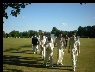
THE LADS SHAKE HANDS AFTER THE ETON GAME

B oth the U12 and the U14 Representative Cricket Teams have been busy in the early part of the season with prestigious friendlies being played against some of the country's top public schools.