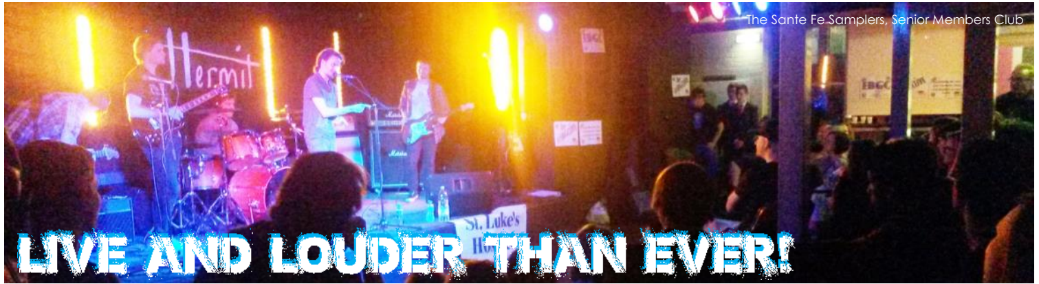
The Sante Fe Samplers, Senior Members Club