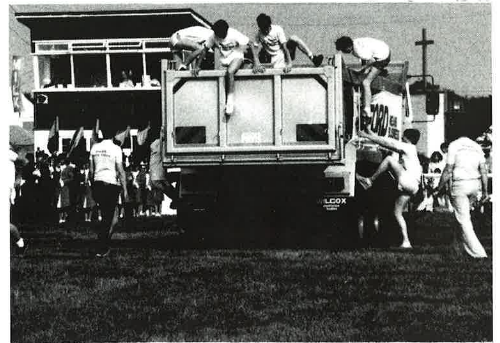
The Superteam final reaches a critical stage and the Essex Music Corps look on.

Saturday brought with it the excitement of our Ring Display. Much of the day was spent in checking and rechecking the plans, showing teams what they would have to do and ensuring the vehicles would be in the right place. Our time came — the Essex Music Corps heralded our arrival, the teams ran in following the army vehicles which were billowing out red smoke from cannisters to provide a really spectacular entrance. Once ready the teams set off, carrying a ladder round the course and finally carrying each other. Ashingdon defeated Mersea in the final to receive the Red Advertiser Trophy and as the Essex Music Corps played us out we received congratulations from spectators and organisers. It had all been very worthwhile, and Essex Boys' Clubs were seen to be very much a part of Essex Show tradition.