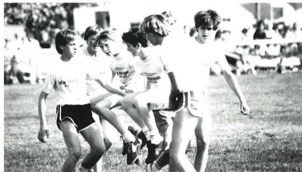
Ashington Boys' winning team at the Essex Show Superteam Event.