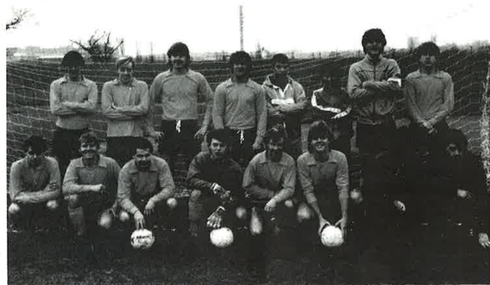
1984/5 Gillette Cup u.18 Representative side.