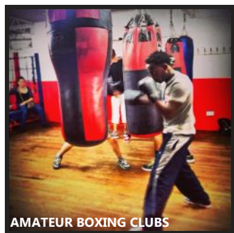
AMATEUR BOXING CLUBS

Alma ABC Berry ABC Billericay Boys' Club Brentwood Youth ABC Canvey Boys' Club Centurions ABC Chadwell St Mary ABC Chalvedon ABC Chelmsford ABC Colchester ABC Cuban Boxing Academy Dagenham P&C ABC Dale Youth ABC Essex University ABC Fairbairn ABC Finchley ABC Five Star Youth Gateway ABC Halstead ABC Haringey P&C ABC Harlow ABC Harwich ABC Holland Shore ABC Hooks Boxing ABC Hornchurch & Elm Park ABC Islington ABC Lynn AC Boxing Club Mayland Sports & Development ABC Nemesis ABC Newham ABC Northolt ABC Orpington ABC Rayleigh ABC Rayne ABC Repton Boys' Club Romford ABC Ruislip & District ABC Southend ABC St Pancras ABC Stowe ABC Sudbury ABC Tilbury Dockers ABC Vange & Pitsea ABC West Ham Boys & ABC