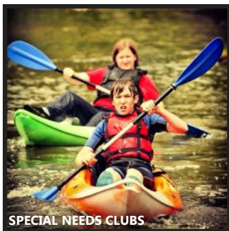
SPECIAL NEEDS CLUBS