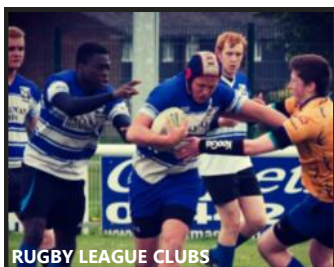
RUGBY LEAGUE CLUBS

Alma ABC Berry ABC Billericay Boys' Club Brentwood Youth ABC Canvey Boys' Club Centurions ABC Chadwell St Mary ABC Chalvedon ABC Chelmsford ABC Colchester ABC Cuban Boxing Academy Dagenham P&C ABC Dale Youth ABC Essex University ABC Fairbairn ABC Finchley ABC Five Star Youth Gateway ABC Halstead ABC Haringey P&C ABC Harlow ABC Harwich ABC Holland Shore ABC Hooks Boxing ABC Hornchurch & Elm Park ABC Islington ABC Lynn AC Boxing Club Mayland Sports & Development ABC Nemesis ABC Newham ABC Northolt ABC Orpington ABC Rayleigh ABC Rayne ABC Repton Boys' Club Romford ABC Ruislip & District ABC Southend ABC St Pancras ABC Stowe ABC Sudbury ABC Tilbury Dockers ABC Vange & Pitsea ABC West Ham Boys & ABC