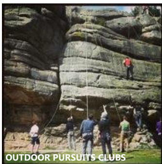
OUTDOOR PURSUITS CLUBS

Brentwood Eels RLFC Eastern Rhinos RLC Southend Spartans RLFC