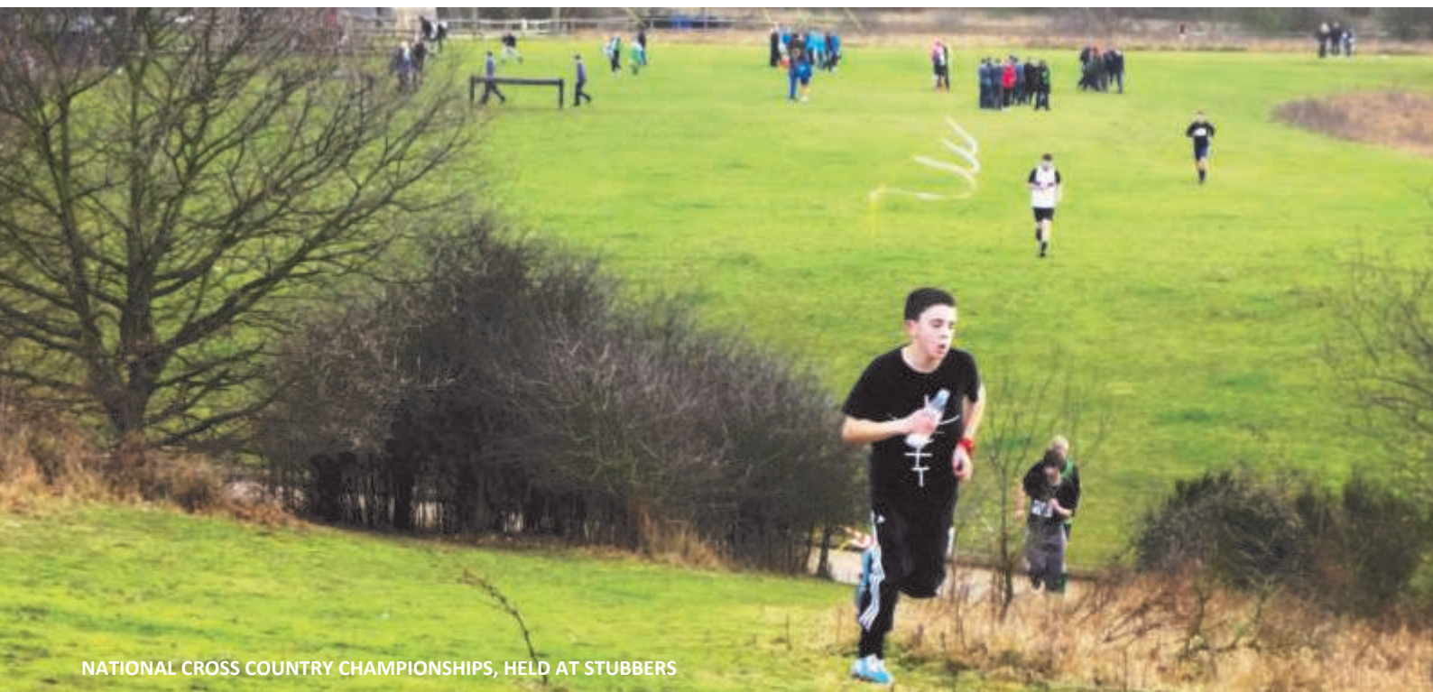
NATIONAL CROSS COUNTRY CHAMPIONSHIPS, HELD AT STUBBERS