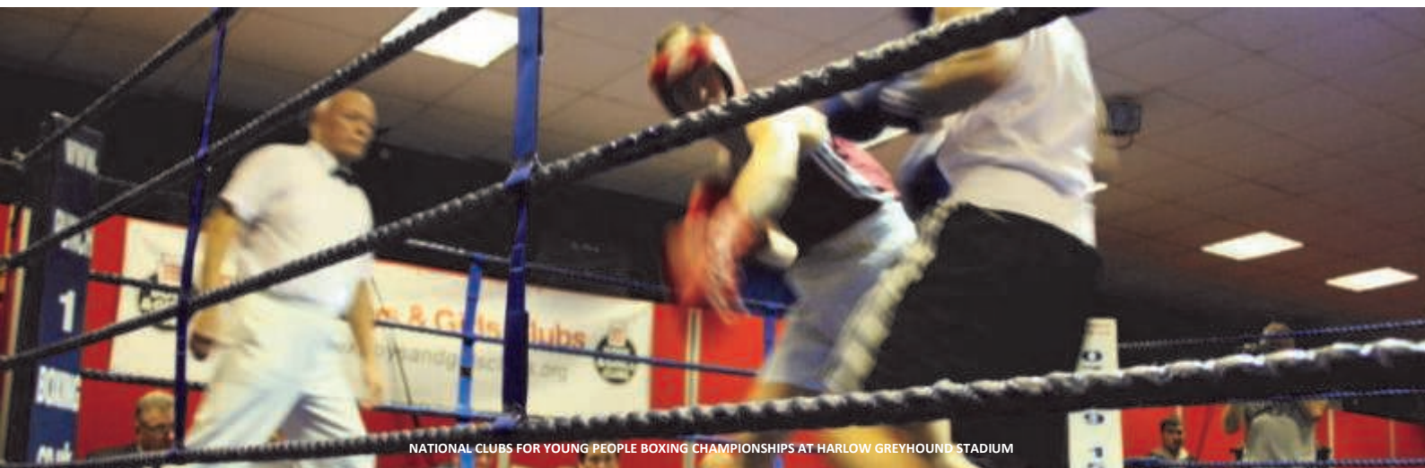
NATIONAL CLUBS FOR YOUNG PEOPLE BOXING CHAMPIONSHIPS AT HARLOW GREYHOUND STADIUM